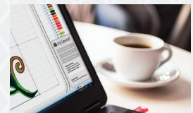
CLOUD STORAGE LETS YOU TRANSFER YOUR DESIGNS FROM ANYWHERE