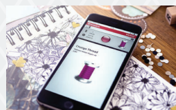
GET REAL-TIME EMBROIDERY UPDATES ON YOUR MOBILE DEVICE