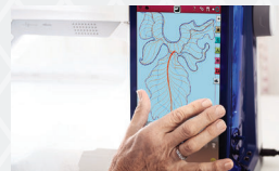
INTERACTIVE TABLET-LIKE SCREEN - 10.1 INCHES