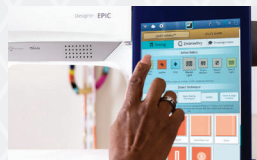
JoyOS Advisor™ SETS THE STITCH, THREAD AND FOOT SETTINGS FOR YOU